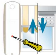
Jog = motor ready to remove control