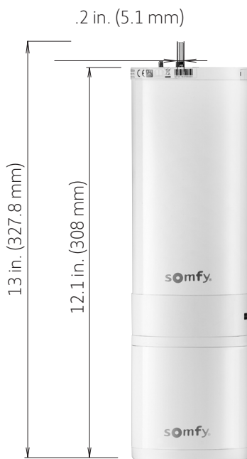
Motor and Battery